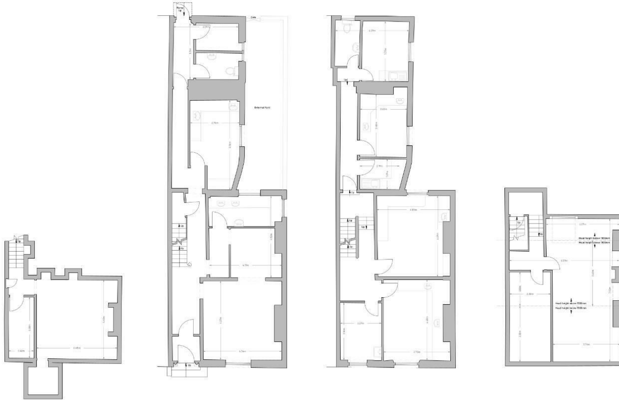
Basement GIA 25.8m 2